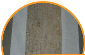
Diamond Shaved Preparation