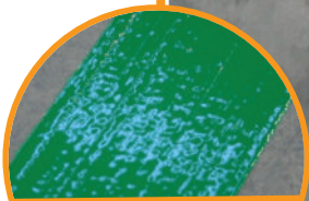
Diamond Shaved Finished