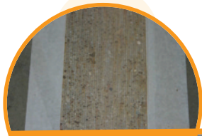
Diamond Shaved Preparation