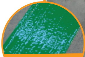
Diamond Shaved Finished